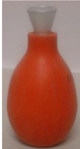
Powder Spray Bub