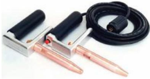
Standard Prod Sets