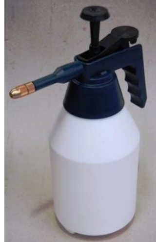
Polyspray A spray unit for the application of magnetic ink