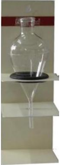
Centrifugal Tube & Stand