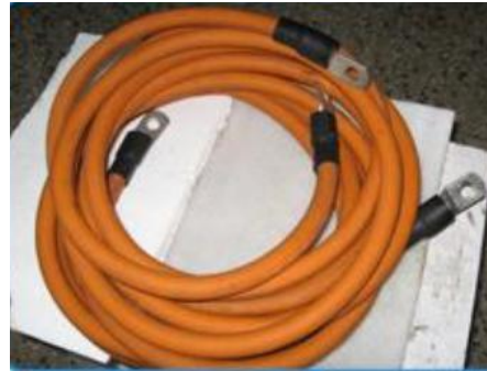
Cables 120 Sq mm for Portable MPI Suitable for Portable MPI Power source 1500 Amps & 2000 Amps