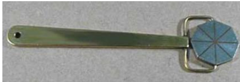
Pie Field Indicator