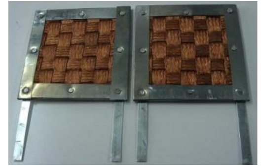
Double Braided Copper pads