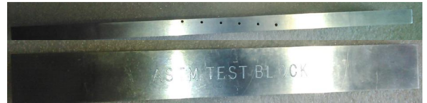
ASTM MPI BLOCK