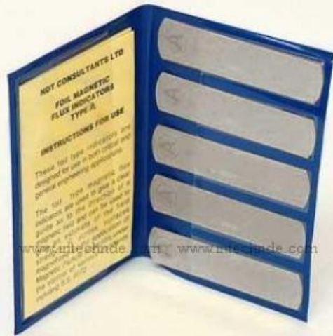
Magnetic Flux Strips