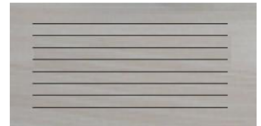
BHEL Test Block