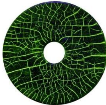
MTU Test Block